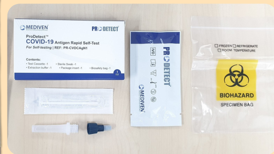
Consisting of Test Cassette, Extraction buffer, Sterile swab, Package Insert & Biosafety bag